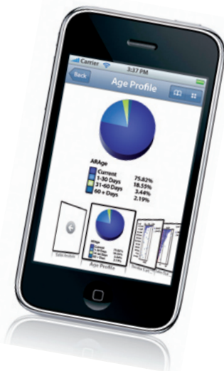
QlikView for iPhone

Fully-functional free QlikView Developer for Personal Use, and seeing is believing experience